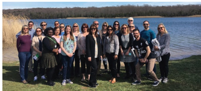
New Jersey Healthy Communities Network grantees

for Population Health Sciences. "By investing in the settings in which our patients live, learn, work and play, we're sending a clear message that we care about their health, even before they walk into our doors."