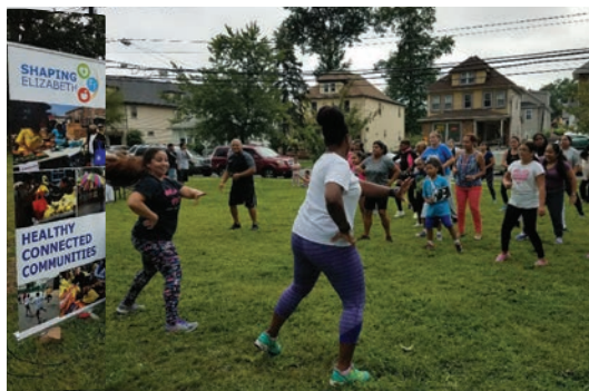
Community members participate in a fun fitness demonstration hosted by Shaping Elizabeth