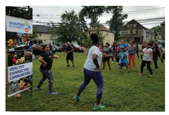
Community members participate in a fun fitness demonstration hosted by Shaping Elizabeth