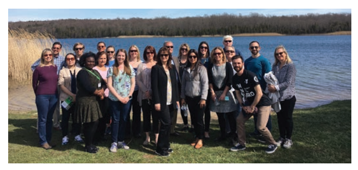
New Jersey Healthy Communities Network grantees

for Population Health Sciences. "By investing in the settings in which our patients live, learn, work and play, we're sending a clear message that we care about their health, even before they walk into our doors."